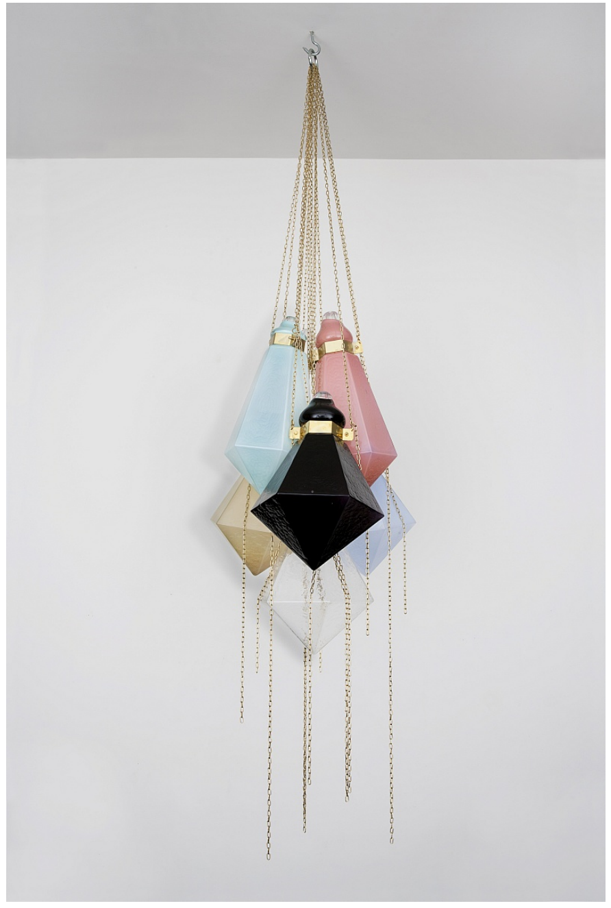
FRIDA FJELLMAN (Swedish, b.1971) Lustre aux Couleurs Arts Deco, 2016 Glass, brass 62" H x 24" W Unique