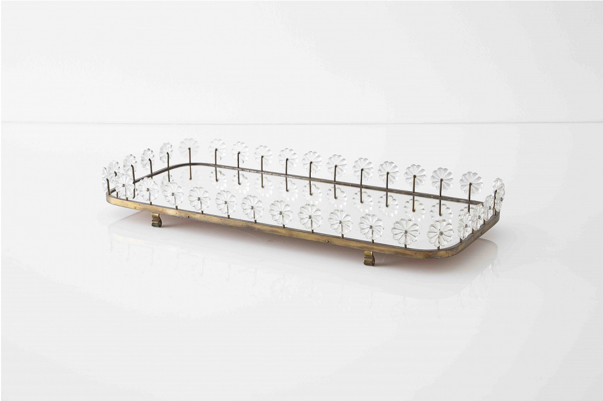
ESTRID ERICSON (Swedish, 1894-1981) Mirror Tray, Svenskt Tenn, Sweden, ca. 1950 lucite flowers, brass, mirror 22" L x 10" W x 3" H