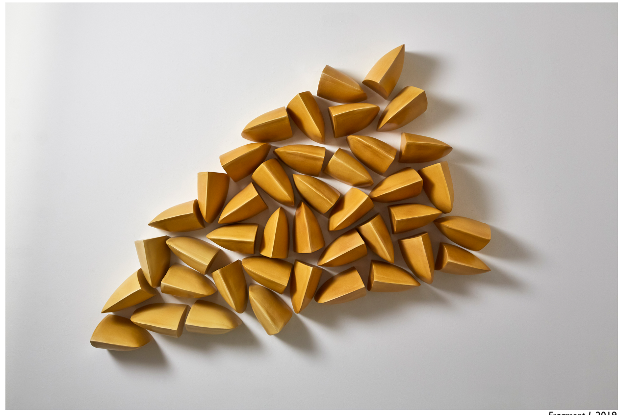
Fragment I, 2019