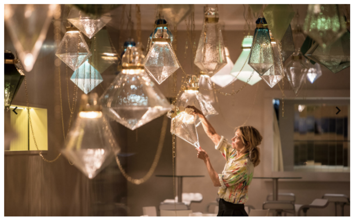
Netjets enlisted Swedish artist Frida Fjellman, pictured, to create an installation for their collectors' lounge at Art Basel