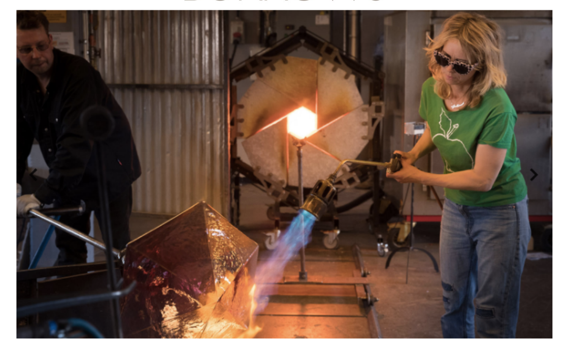
The artist worked closely with The Glass Factory, an art workshop from Boda, a small village in the middle of Sweden's forests