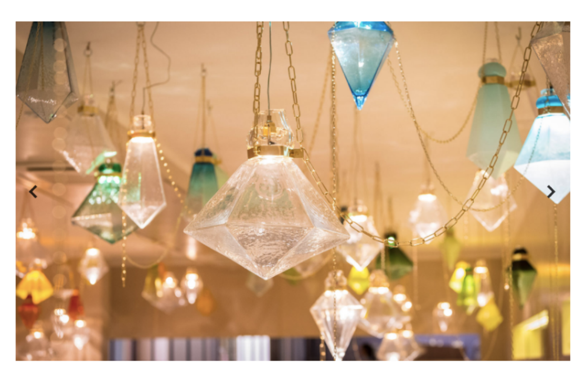
The lanterns hung on the ceiling in colour clusters, and the lights were discreetly turned on and off with a slow breathing pulse. 'My intention was to create a calming environment to de-stress from the fair,' says the artist